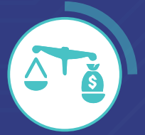
Risk Management and Compliance Firms