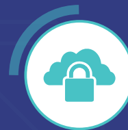
Mobile and Cloud Security