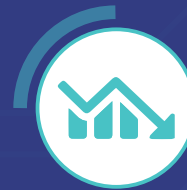
Operational Risk Organizations