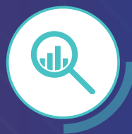
Information Systems Audit