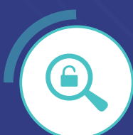
Threat Detection and Management