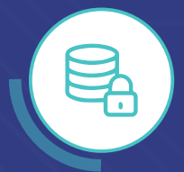
Network and Data Security