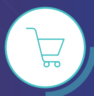
Retail and Commerce